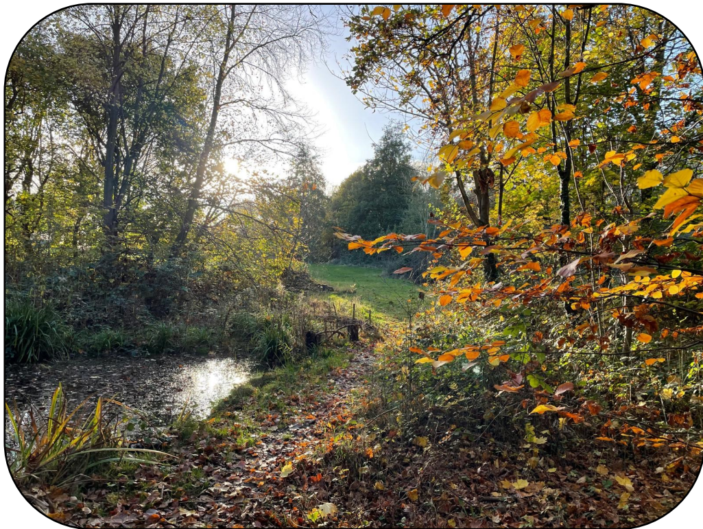
The pond at Aston on Trent Local Nature Reserve